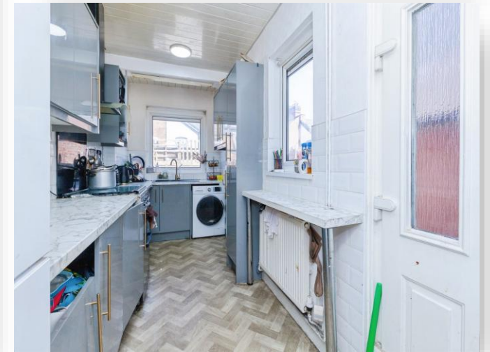
Earl Howe Street, Leicester LE2 0DF