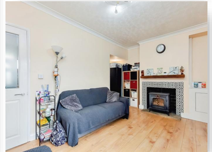
Station Road, Irchester Wellingborough NN29 7EW