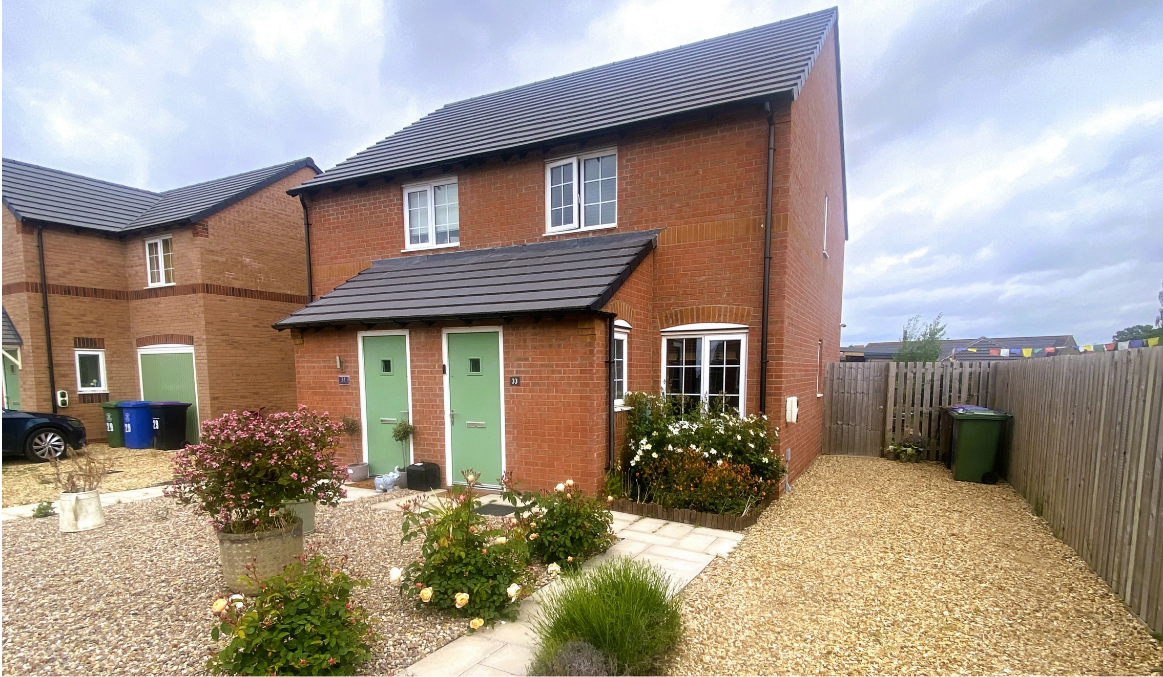
33 Hawthorn Close Fishtoft, Boston