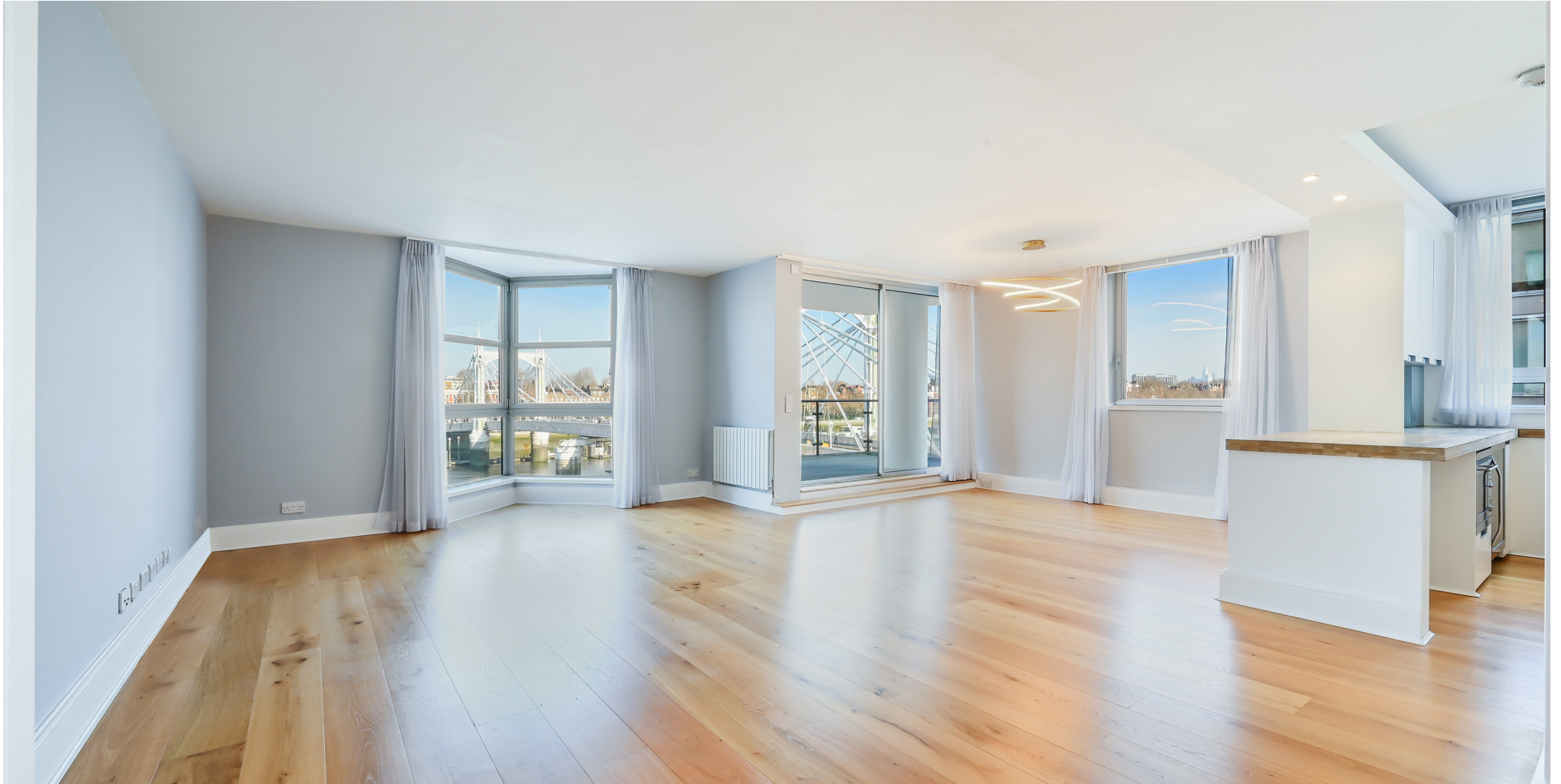
WATERSIDE POINT, Battersea SW11