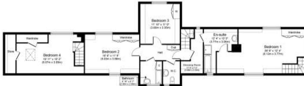
First Floor Approximate Floor Area 1,238 sq. ft. (115.0 sq. m.)