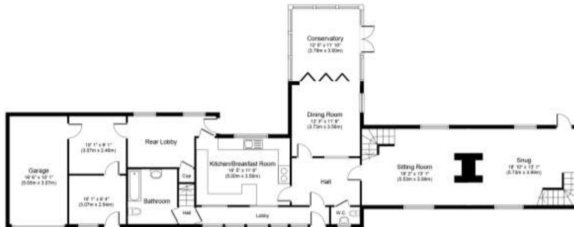
Ground Floor Approximate Floor Area 1,776 sq. ft. (165.0 sq. m.)

Whilst every attempt has been made to ensure the accuracy of the floor plan contained here, measurements of doors, windows, rooms and any other items are approximate and no responsibility is taken for any error, omission, or mis-statement. This plan is for illustrative purposes only and should be used as such by any prospective purchaser or tenant. The services, systems and appliances shown have not been tested and no guarantee as to their operability or efficiency can be given.