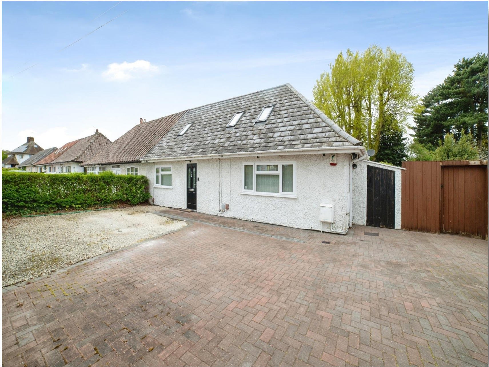
Selston Drive, Nottingham NG8 1EJ