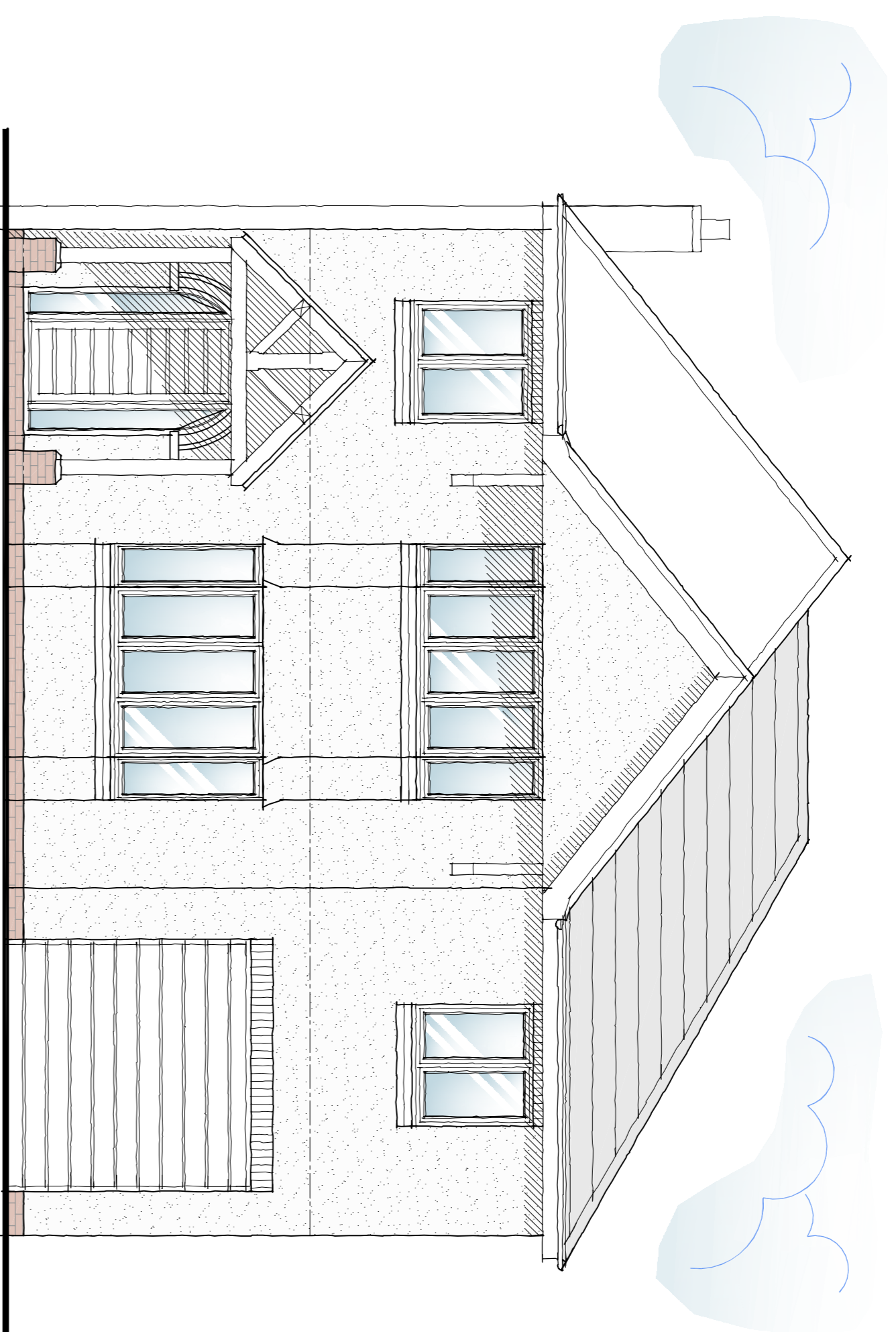
Proposed Front Elevation Scale 1:150

PROPOSED EXTENSIONS & ALTERATIONS - 48 HIGHFIELDS CLOSE - ASHBY DE LA ZOUCH - LEICESTERSHIRE