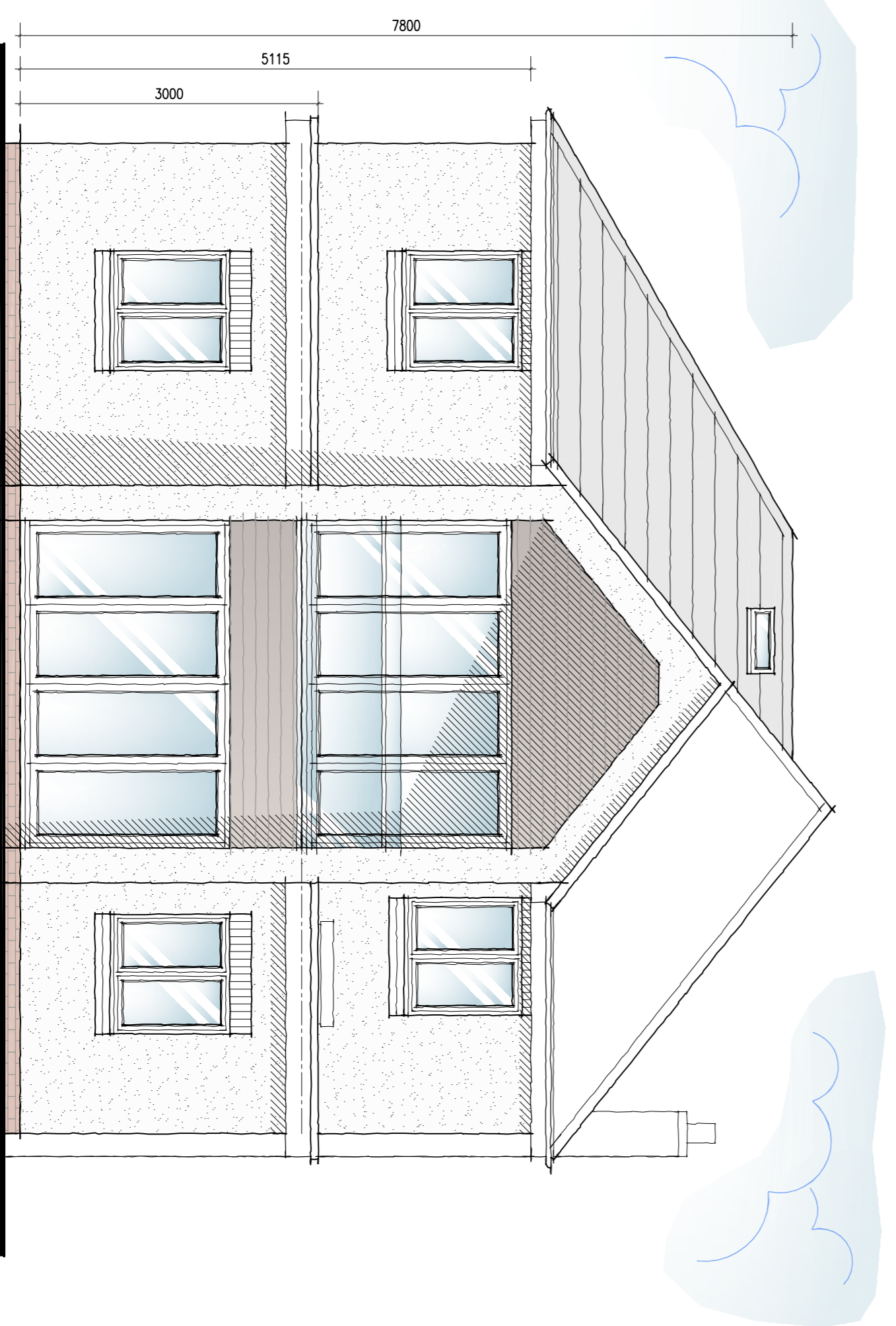
Proposed Rear Elevation Scale 1:150