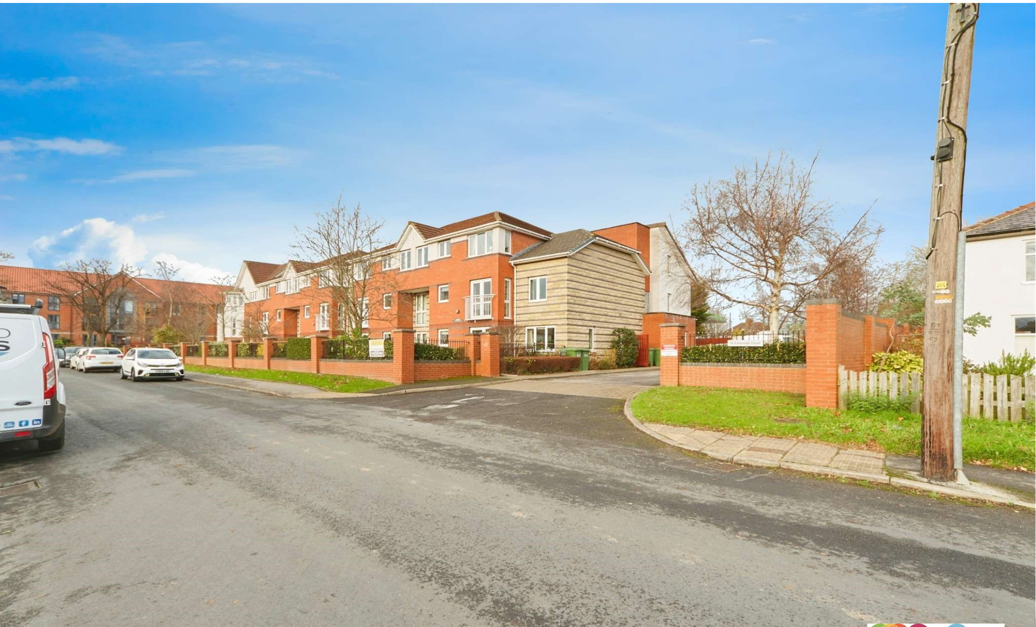
St. Edmunds Court, Leeds LS8 1EZ