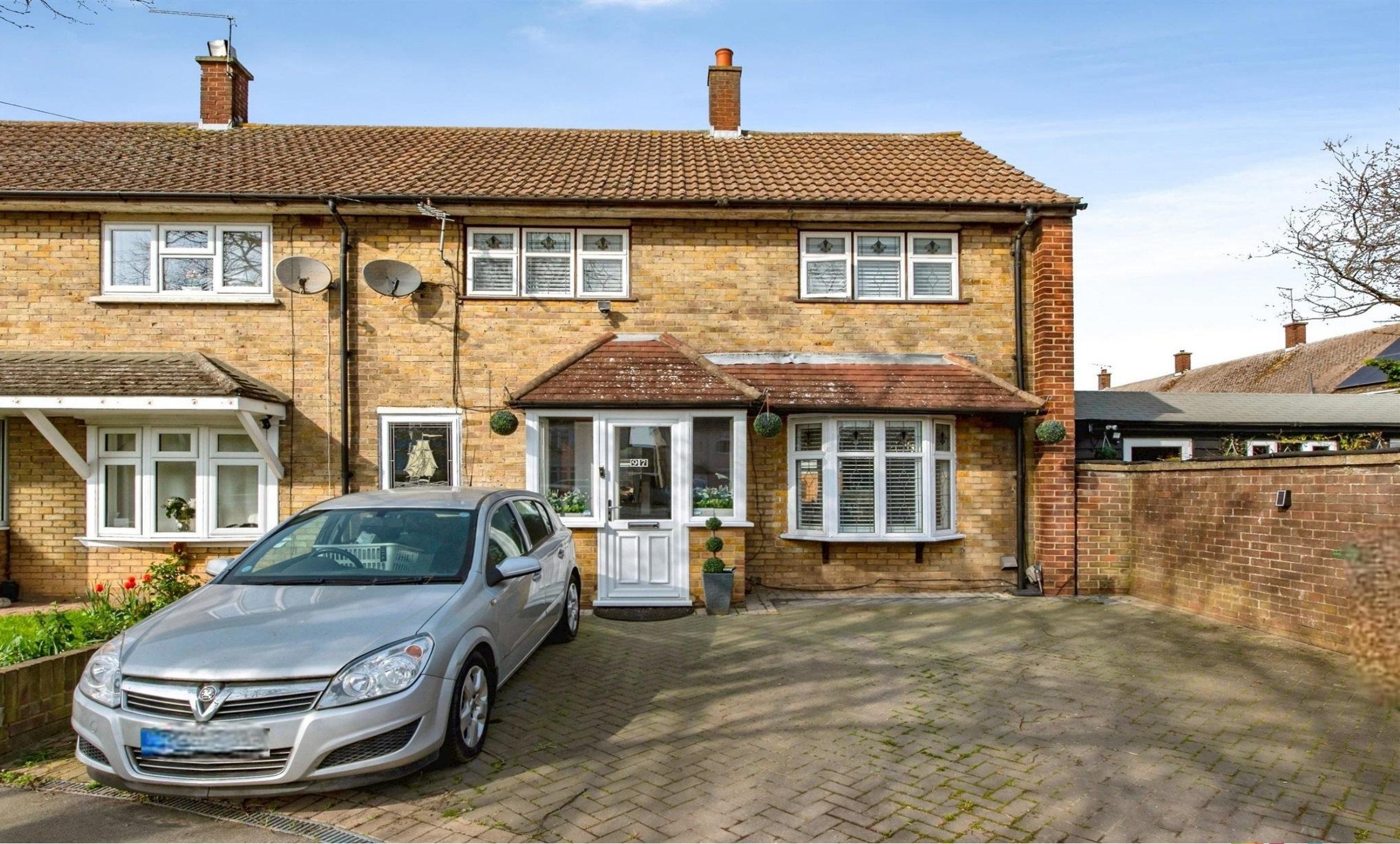
Long Lane, Grays RM16 2PL