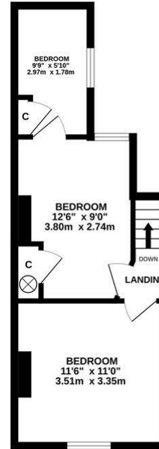
1ST FLOOR 308 sq.ft. (28.6 sq.m.) approx.