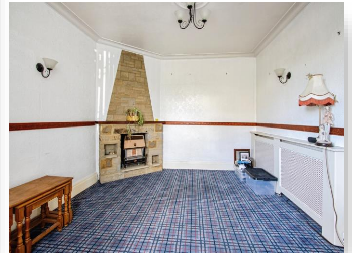
Oak Crescent, Leeds LS15 0DS