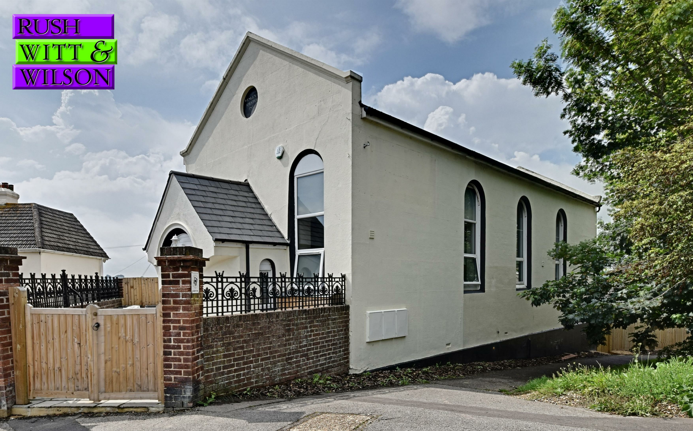
Flat 4 Old Wesleyan Chapel Chapel Path, Bexhill-On-Sea, East Sussex TN40 2AA £210,000 Share of Freehold