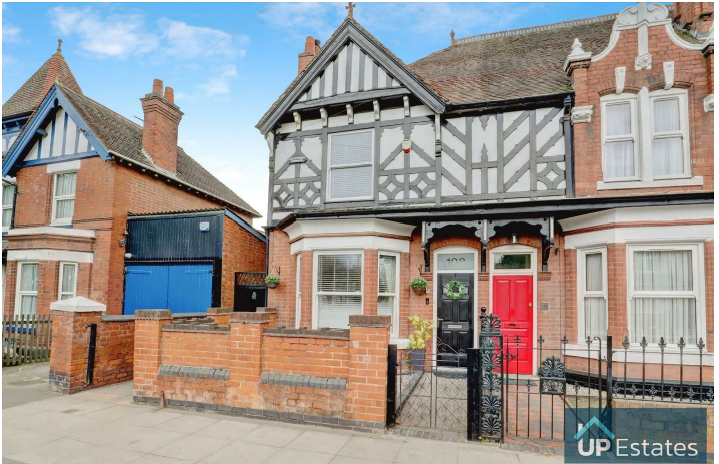
Manor Court Road, Nuneaton