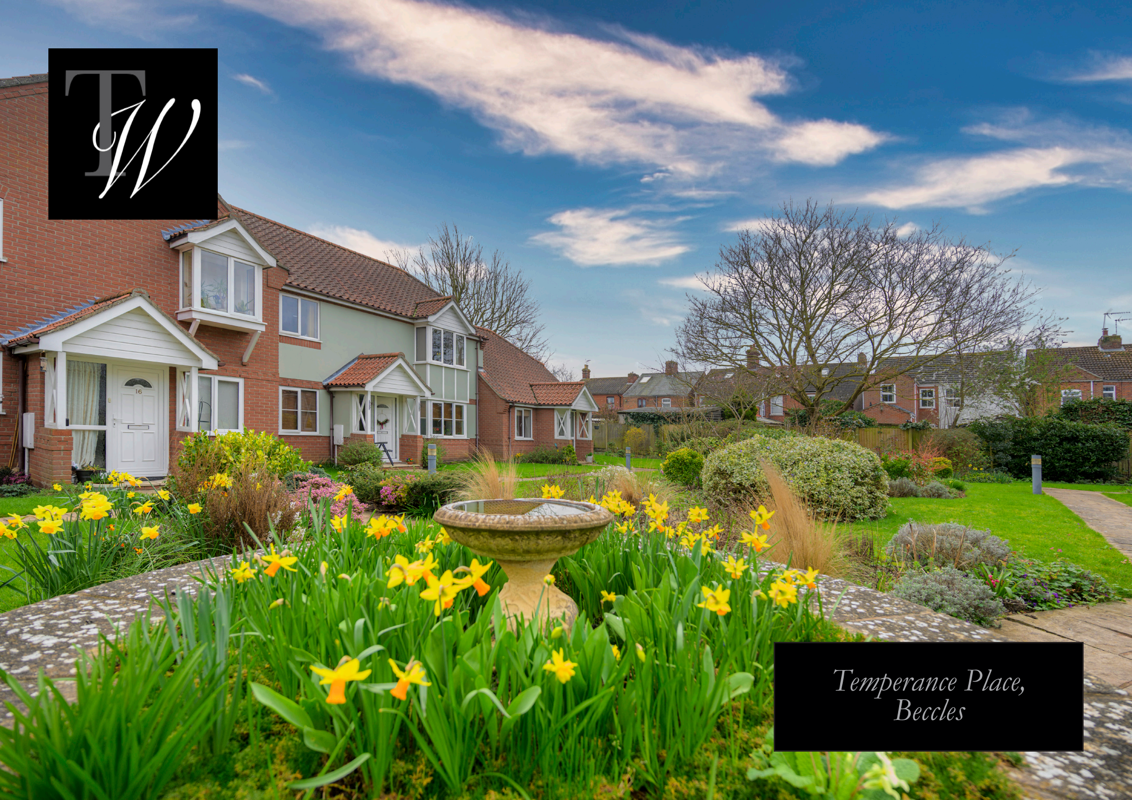
Temperance Place, Beccles