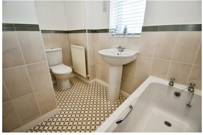
Bathroom 8'8 x 5'7 (2.64m x 1.70m)

Low flush toilet, pedestal sink, panelled bath with half tiled walls and Upvc double glazed window.