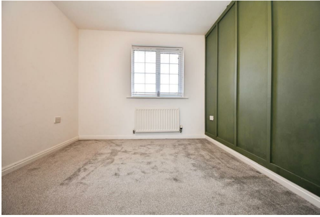
Bedroom Two 9'7 x 8'9 (2.92m x 2.67m)

Upvc double glazed window and central heating radiator. Built in store. En suite.