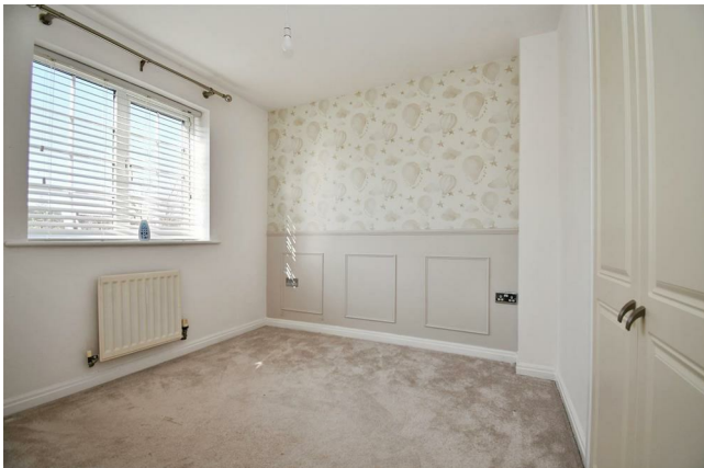
Bedroom Three 10'6 max x 8'6 (3.20m max x 2.59m)

Upvc double glazed window, central heating radiator and built in storage cupboard.