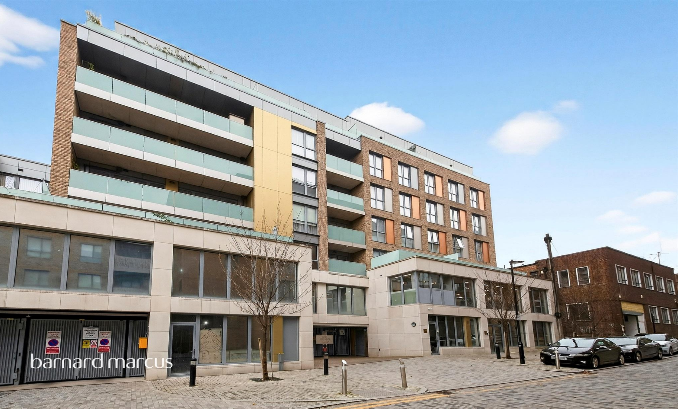
Granita Court Cross Lane, London N8 7GD