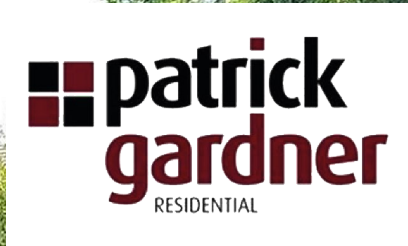
Wayside Worple Road, South Leatherhead, KT22 8HG