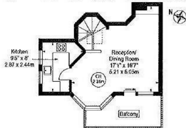
First Floor (395 Sq Ft - 36.34 Sq M)

Approx. Gross Internal Area 635 Sq Ft - 58.99 Sq M Approx. External Area Of Balcony 76 Sq Ft - 7.06 Sq M