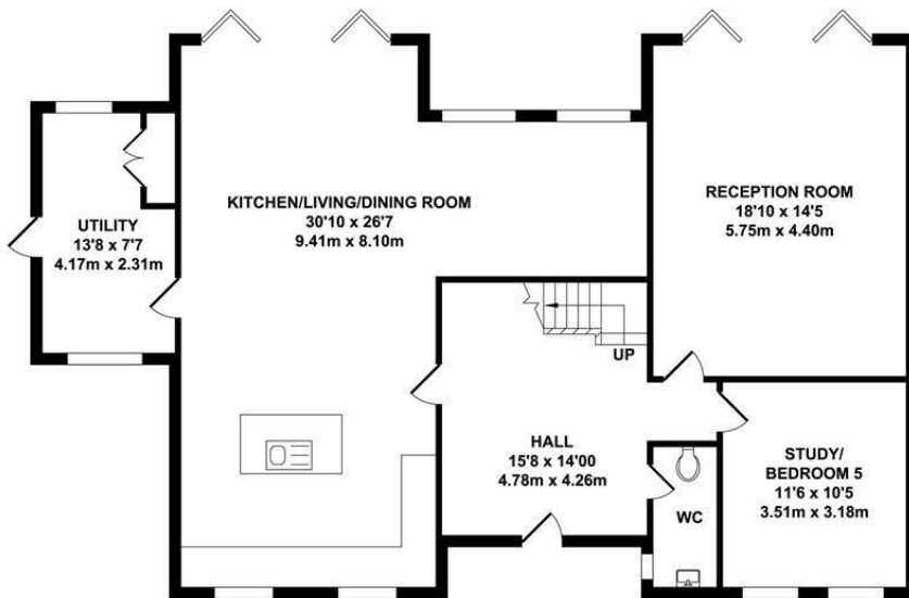
GROUND FLOOR APPROX. FLOOR AREA 1485 SQ.FT. (138.00 SQ.M.)