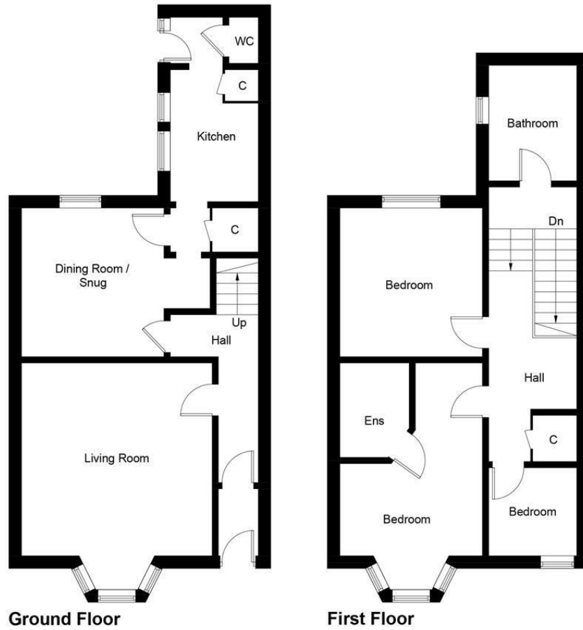
Illustration for identification purposes only, measurements are approximate, not to scale. (ID1240547)