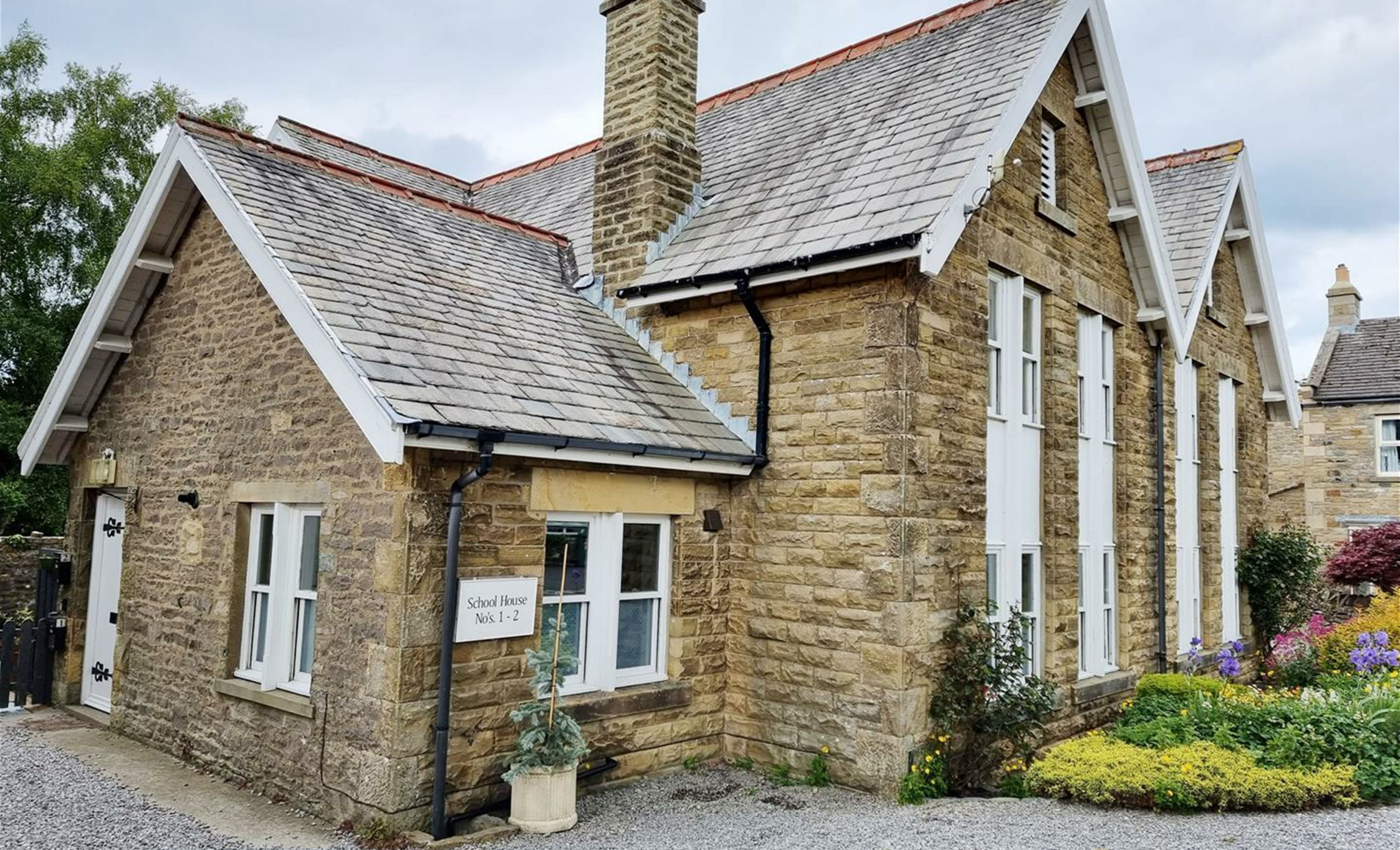
Flat 1, Old School House, West Witton, Leyburn, DL8 4NF £215,000