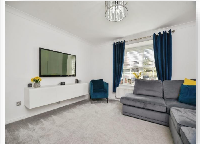
Harlech Court, Ingleby Barwick Stockton-On-Tees TS17 5DR