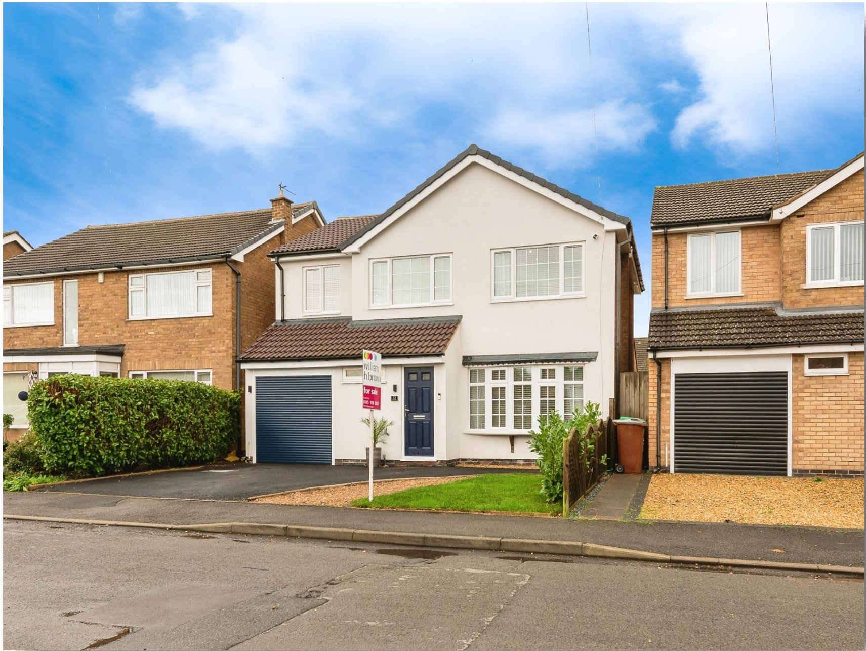
Normanby Road, Nottingham NG8 2TB