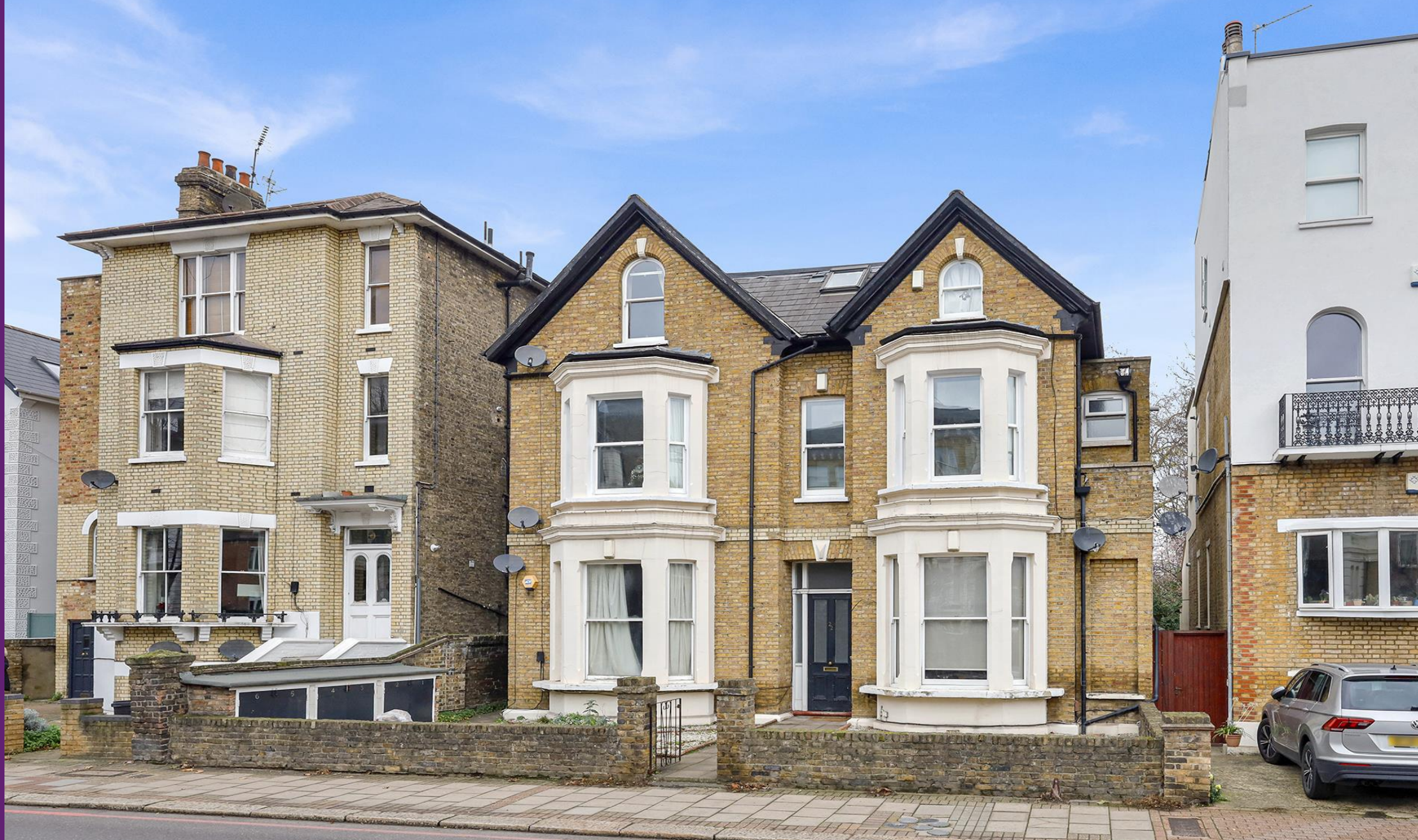
North Side Wandsworth Common Wandsworth, SW18