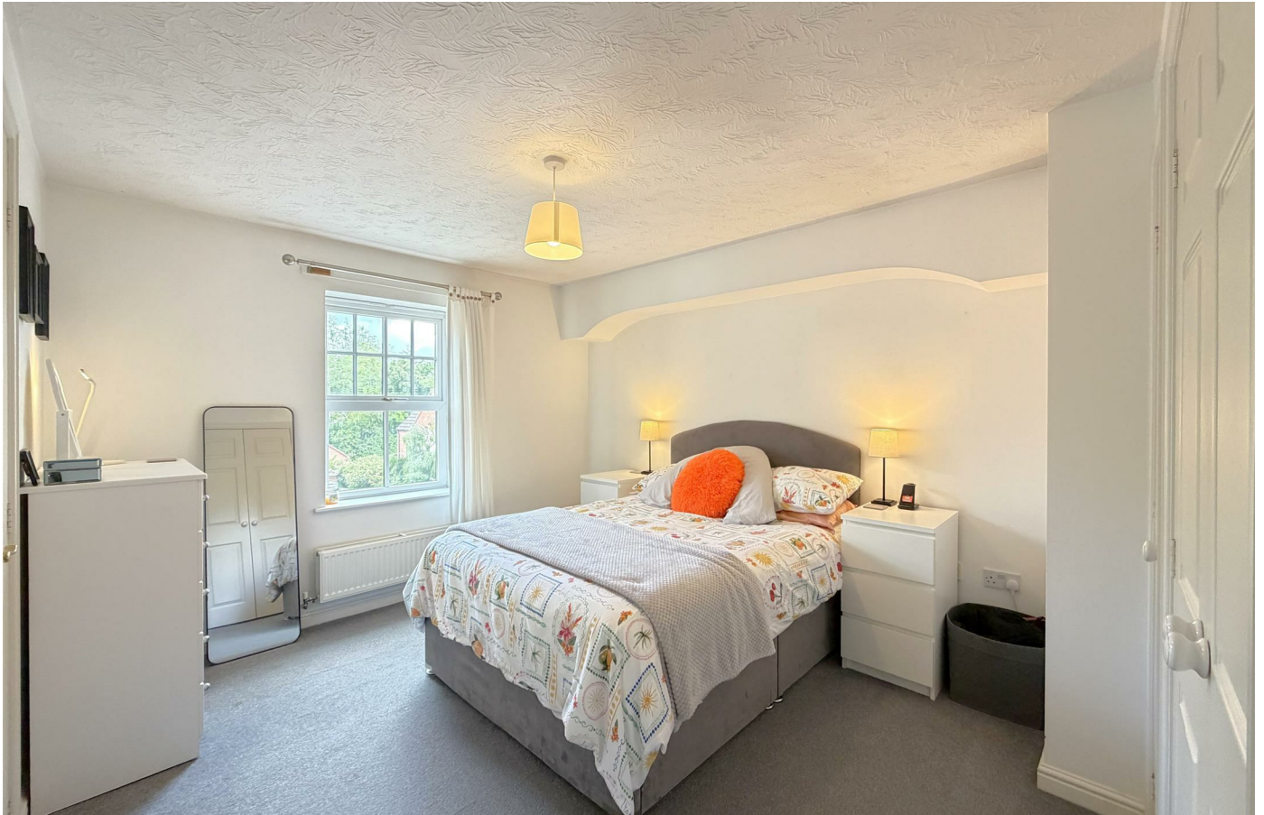
11 Shreres Dyche, Chase Meadow, Warwick, CV34 6BX