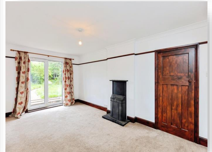
Franklin Fields, Corby NN17 1DJ