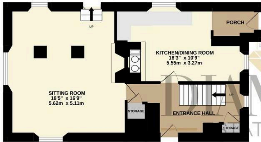
GROUND FLOOR 571 sq.ft. (53.1 sq.m.) approx.