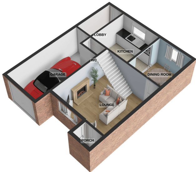
GROUND FLOOR 490 sq.ft. (45.6 sq.m.) approx.