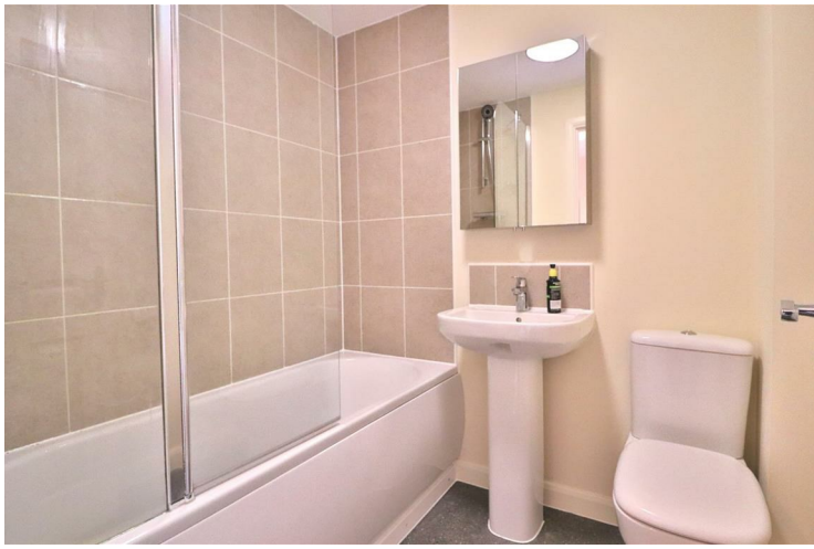
Family bathroom fitted with a low level w.c, pedestal wash hand basin and panelled bath with shower over and glass screen, complete with part tiled walls.