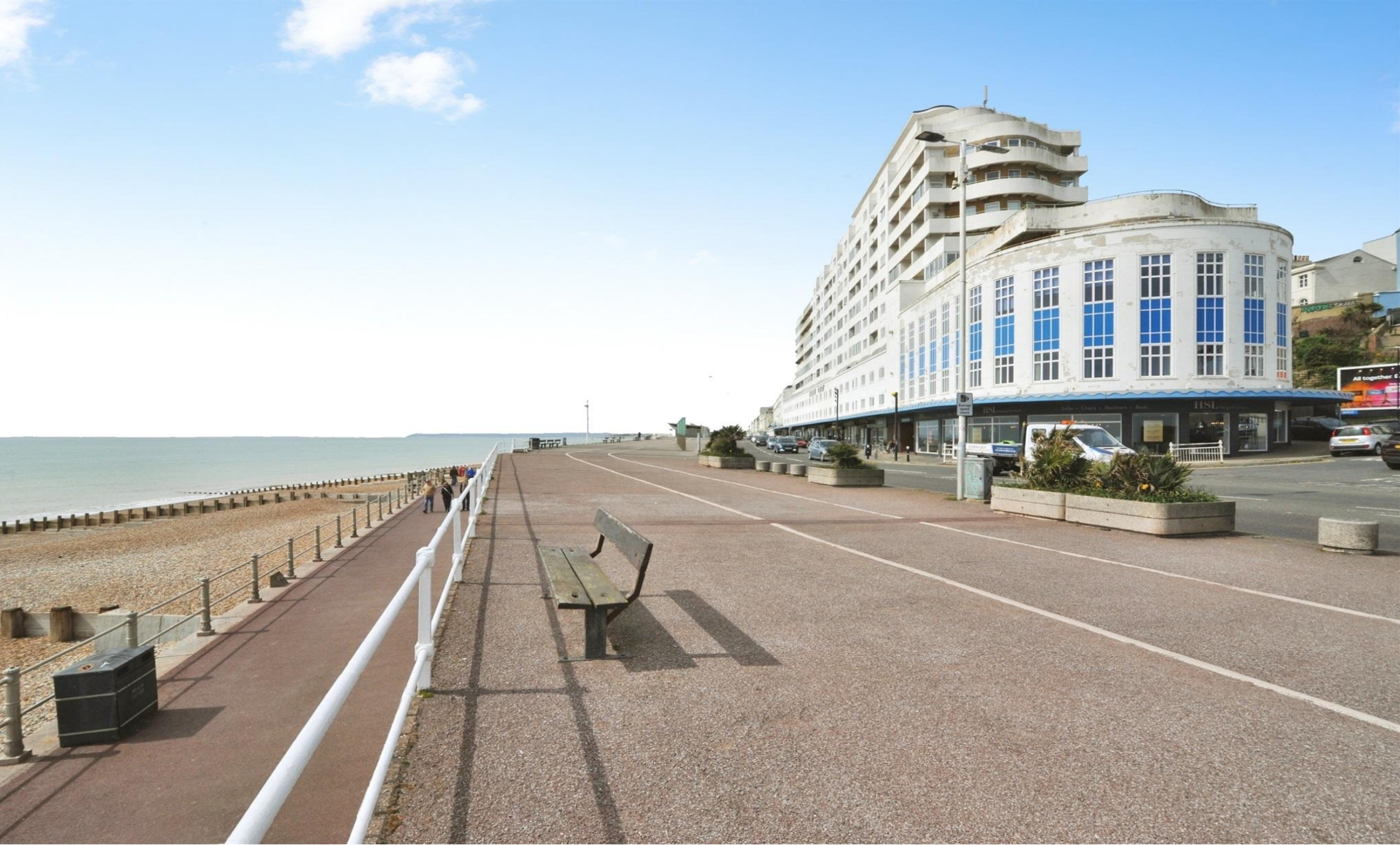
Marine Court, St. Leonards-On-Sea TN38 0DN