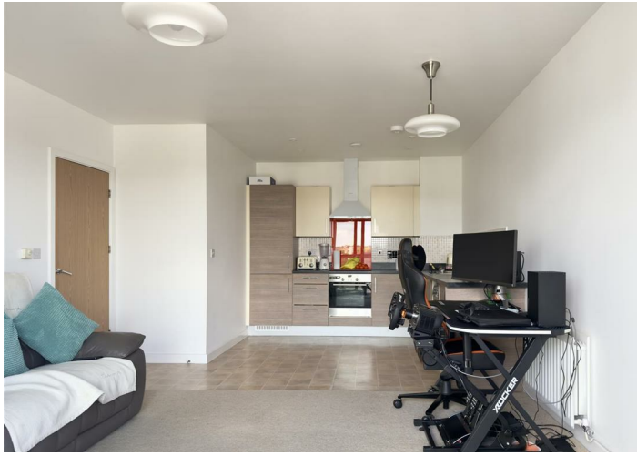
Front door from communal hallway to apartment.