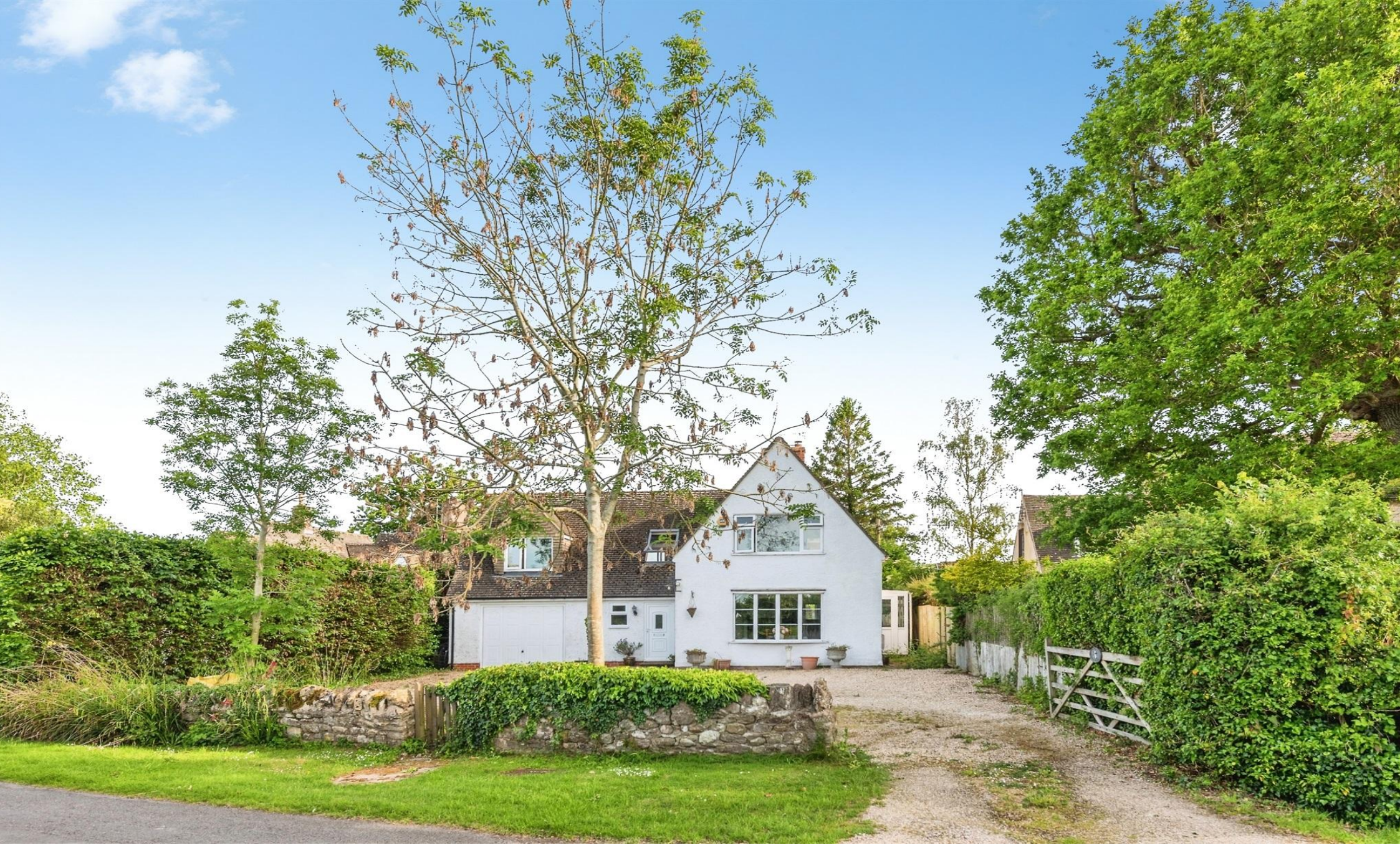
Beech Cottage, South Leigh Road, High Cogges, Witney, OX29 6UW