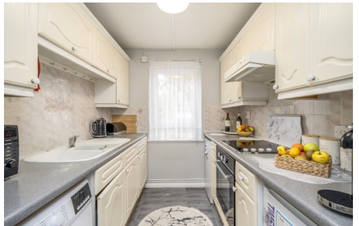
Azof Street, SE10