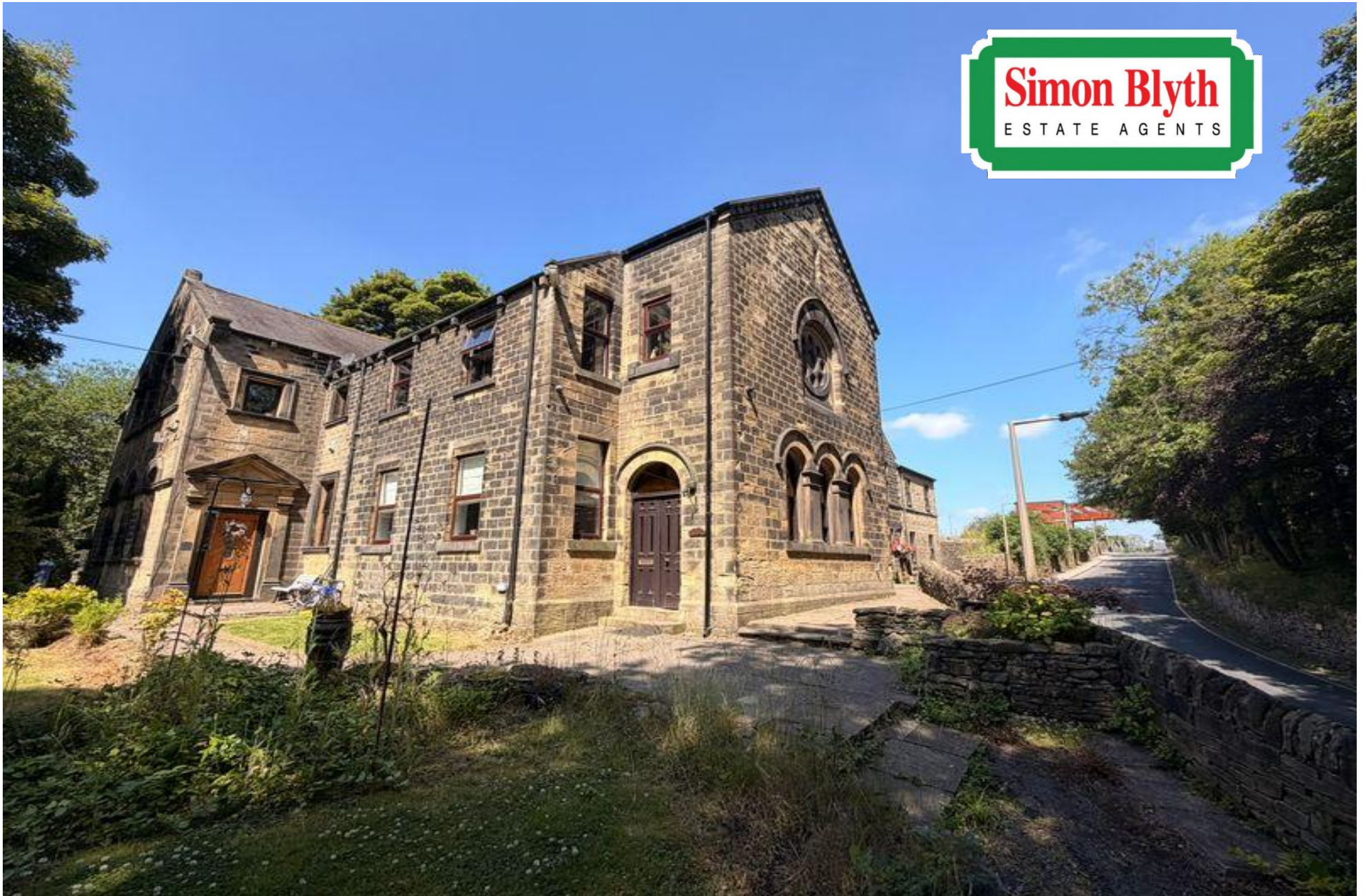
TOLSON COURT, HUDDERSFIELD ROAD, PENISTONE