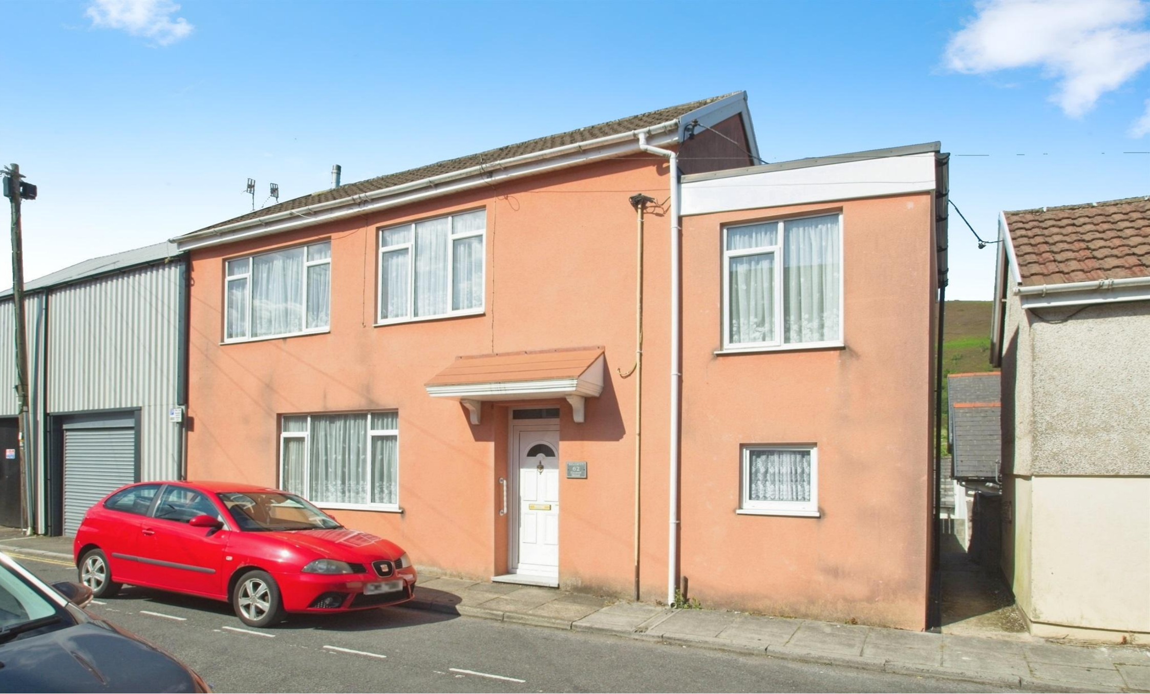
Eleanor Street, Tonypandy CF40 1DP