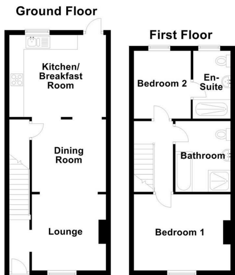
Not to scale. For illustrative purposes only

You may download, store and use the material for your own personal use and research. You may not republish, retransmit, redistribute or otherwise make the material available to any party or make the same available on any website, online service or bulletin board of your own or of any other party or make the same available in hard copy or in any other media without the website owner's express prior written consent. The website owner's copyright must remain on all reproductions of material taken from this website.