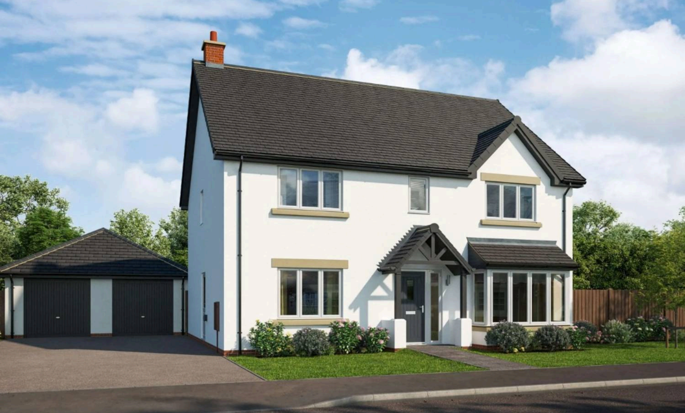
The Willowcrest, Widham Gardens, Station Road Purton