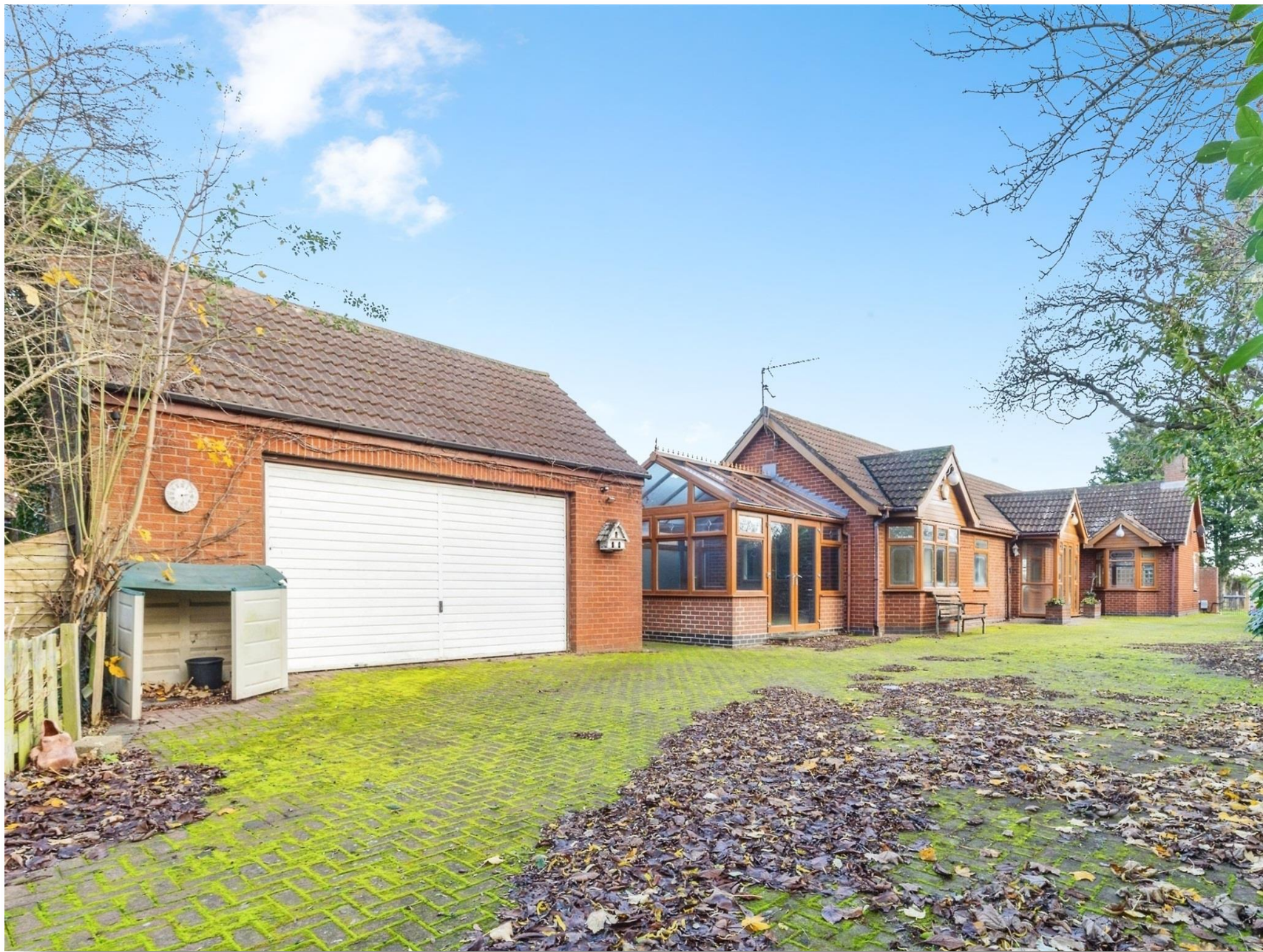
The Croft High Street, Newton-On-Trent Lincoln LN1 2JP