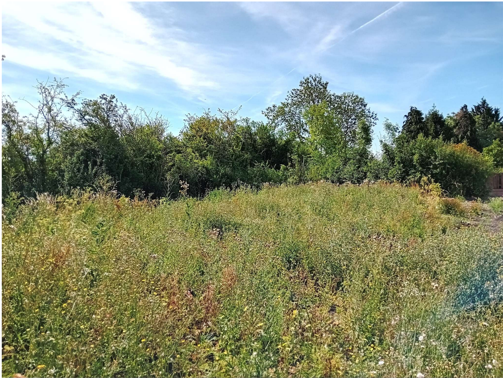
Land On The Southside Of Witham View Gretton Close, Claypole Newark NG23 5AF