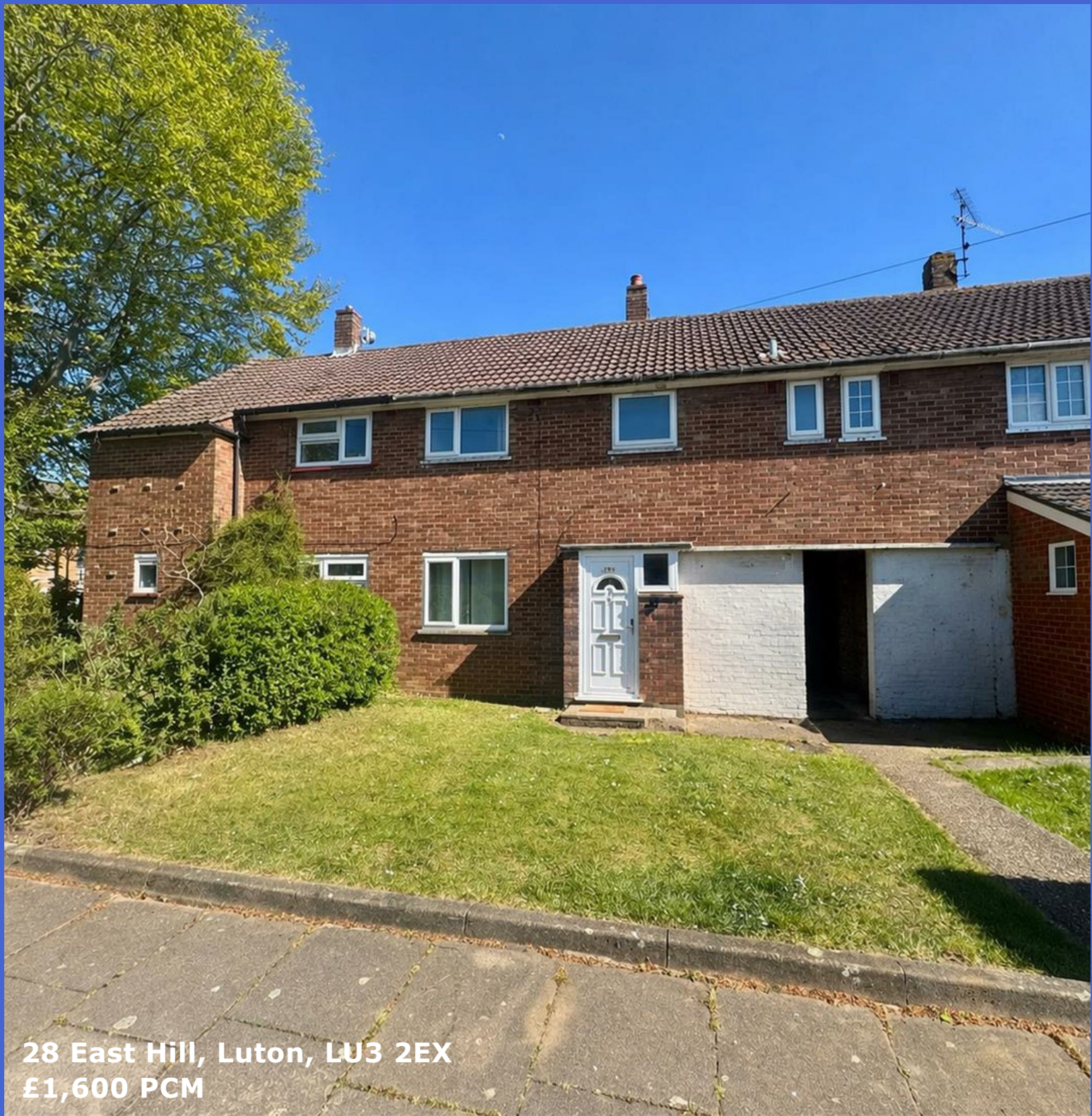
28 East Hill, Luton, LU3 2EX £1,600 PCM