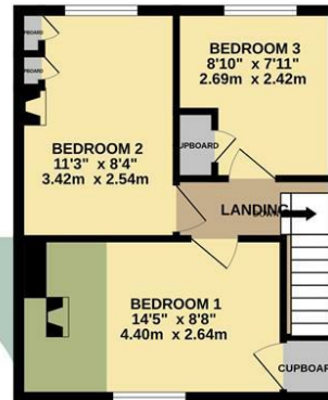
1ST FLOOR 354 sq.ft. (32.9 sq.m.) approx.