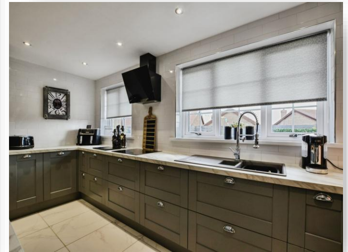
Connaught Drive, Chapel St. Leonards SKEGNESS PE24 5YS