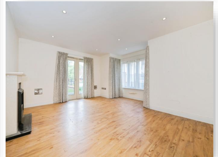
Walter Lane, Eastleigh, SO50 6HD