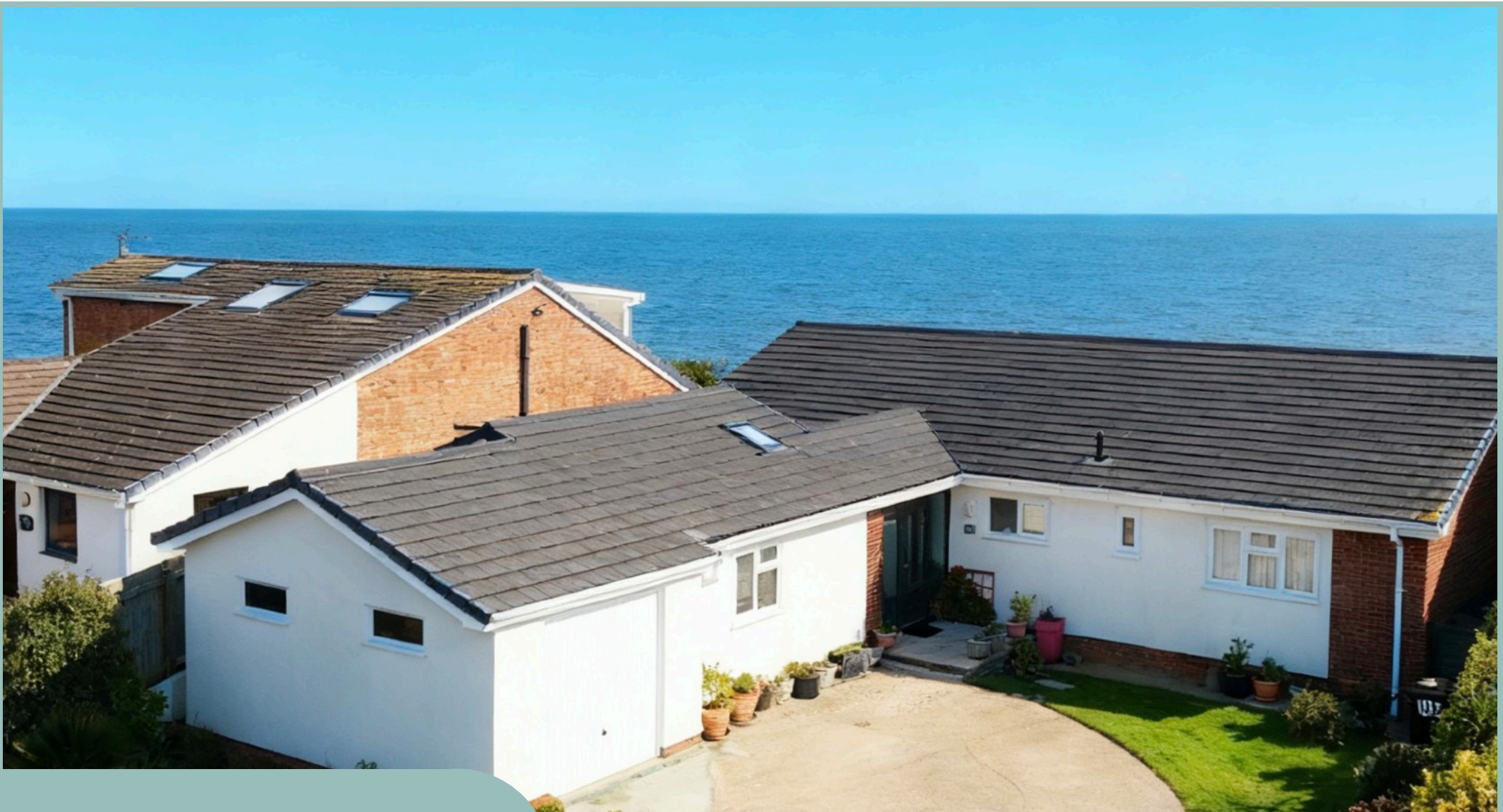
102 Penrhyn Beach East Penrhyn Bay LL30 3RW