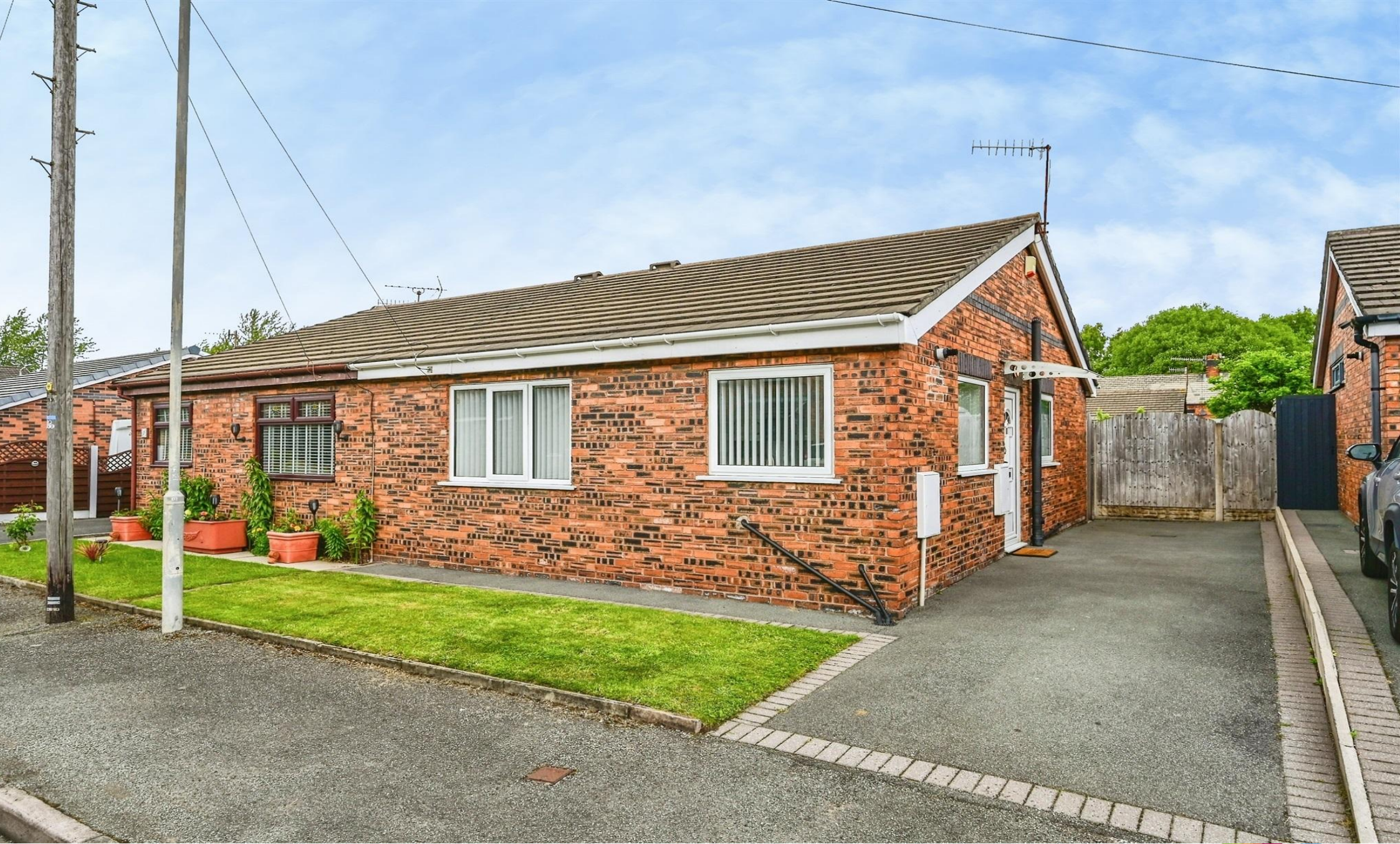
Almond Court, Liverpool L19 2QZ