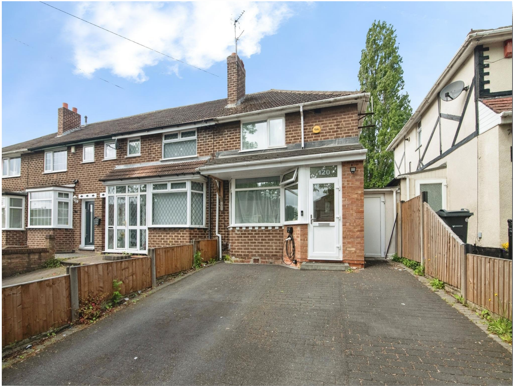
Old Oscott Lane, Birmingham B44 8TS