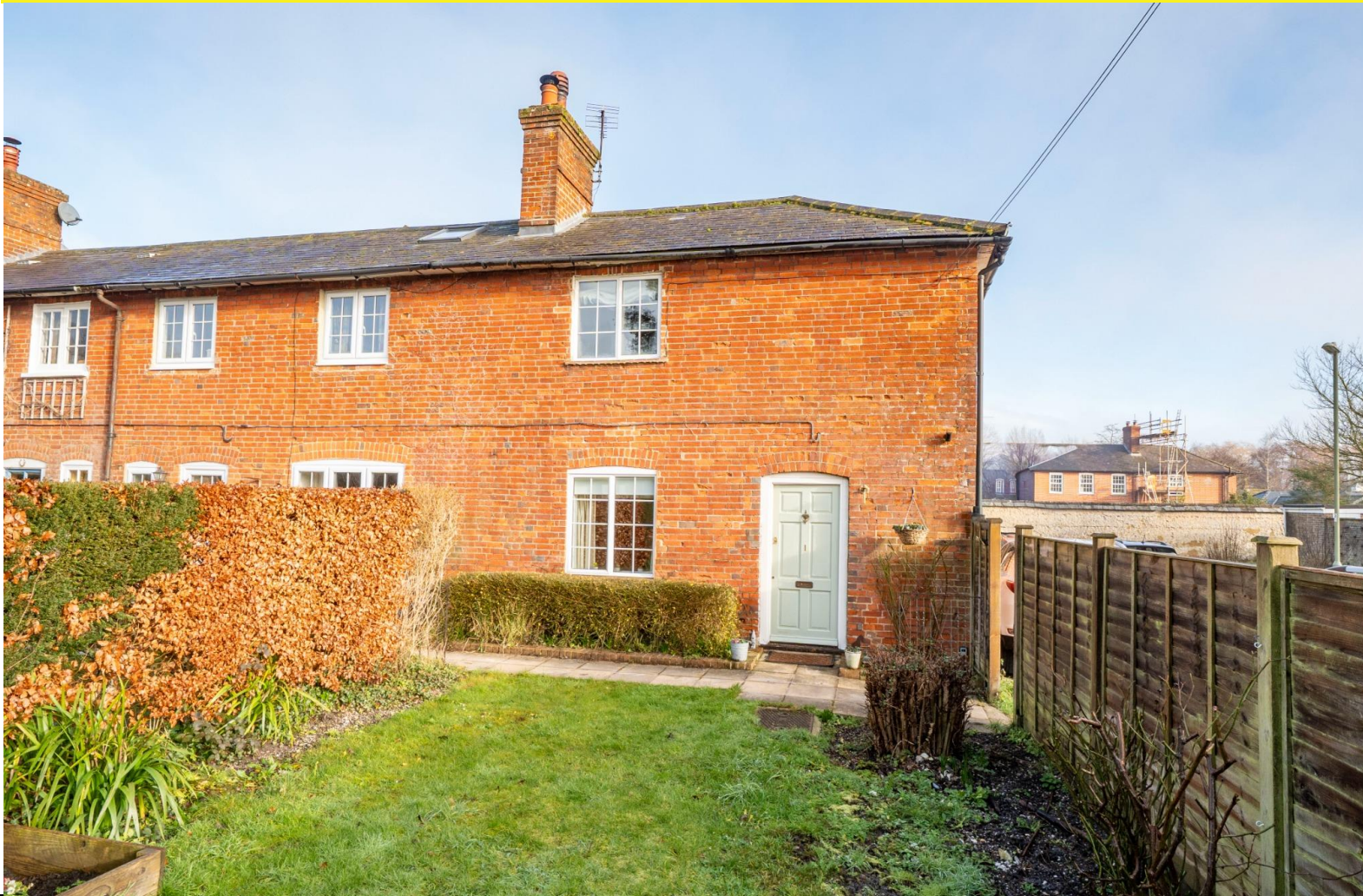
Venison Terrace, Broughton Guide Price £335,000 Freehold

NOTE: These particulars are only intended as a guide to prospective purchasers with a view to taking up negotiations. They are not intended to be relied upon in any way for any purpose and accordingly neither their accuracy nor their continued availability is in any way guaranteed. They are furnished on the express understanding that neither the Agents nor the Vendors are under any liability or claim in respect of their contents. Any prospective purchaser must satisfy themselves by inspecting or otherwise as to the correctness of the particulars contained.