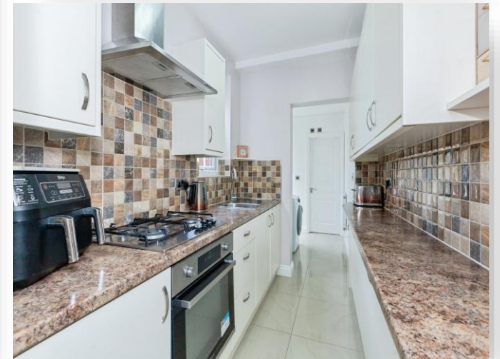
Laurel Road, Leicester LE2 1BN