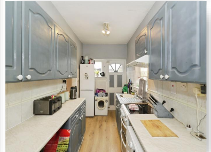
King Edwards Drive, Harrogate HG1 4HA