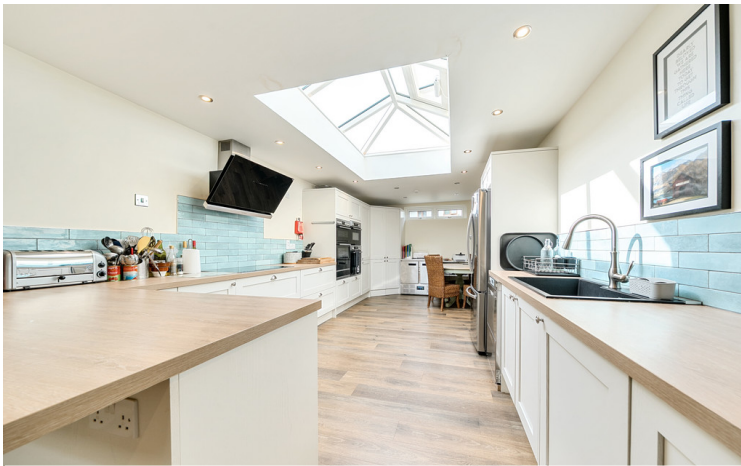
Light and Spacious Kitchen