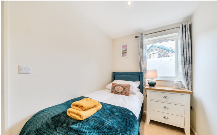
Swirl How - Single Room