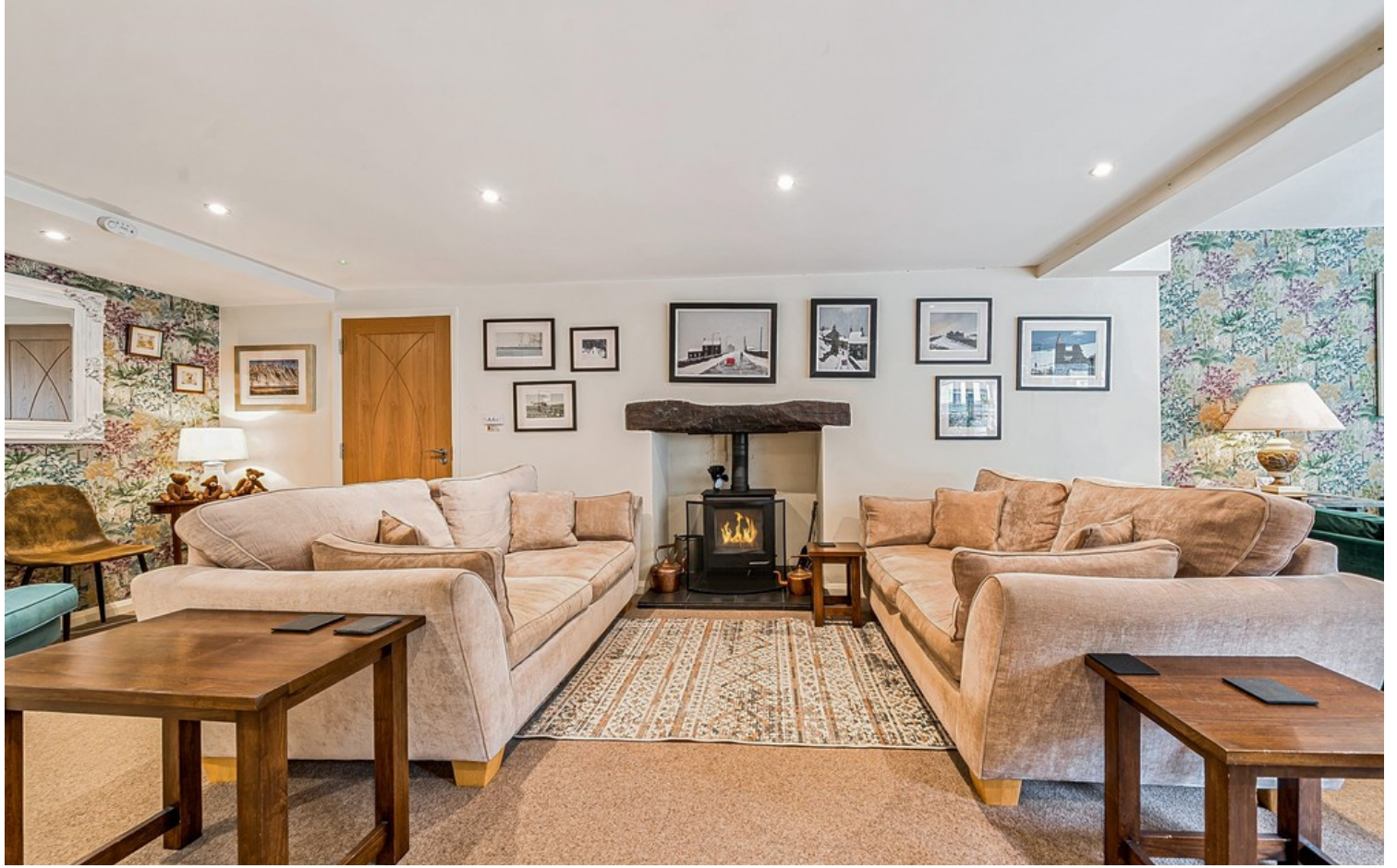
Lounge Sitting Room