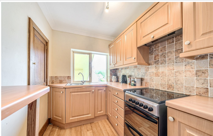
Ruskin - Kitchenette

En Suite Shower Room Having a three piece suite comprising a shower unit, pedestal wash hand basin and WC. With a heated ladder style towel rail/radiator.