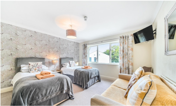
Ruskin - Twin Room and Seating Area

for informal dining, an integrated stainless steel sink and drainer and a space for a cooker with extractor hood over.