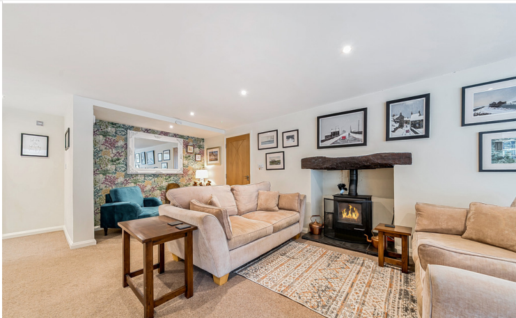
Lounge Sitting Room