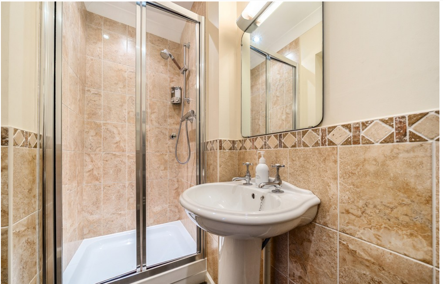
En Suite Shower for Yewdale