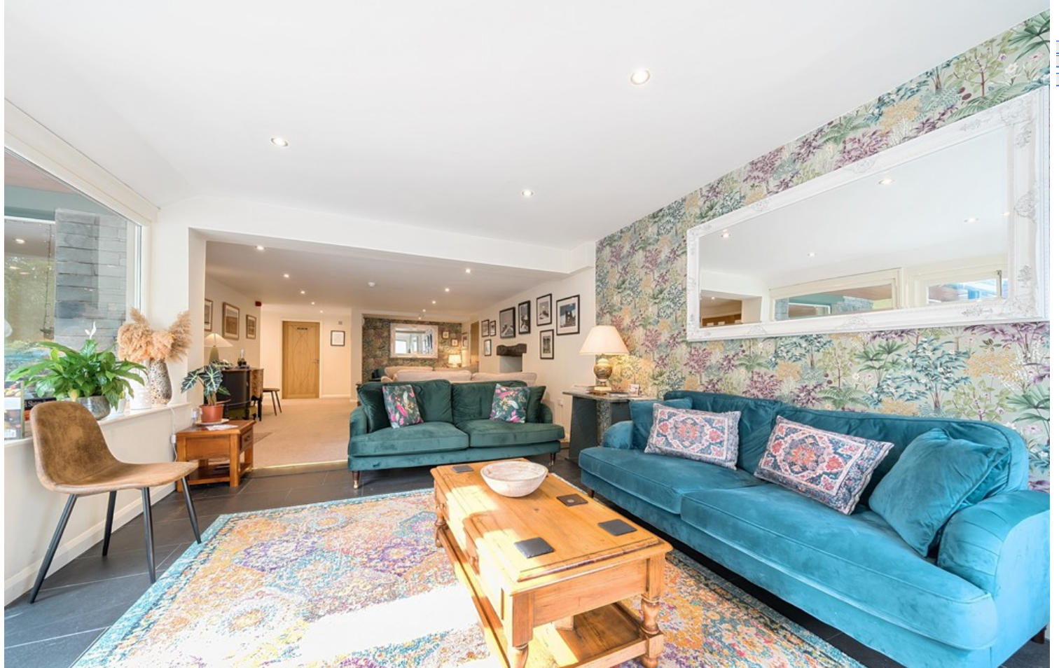
Lounge Sitting Room