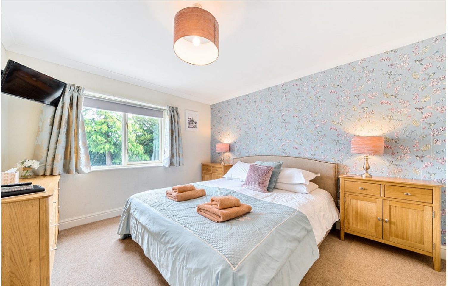
Ruskin - Double Room