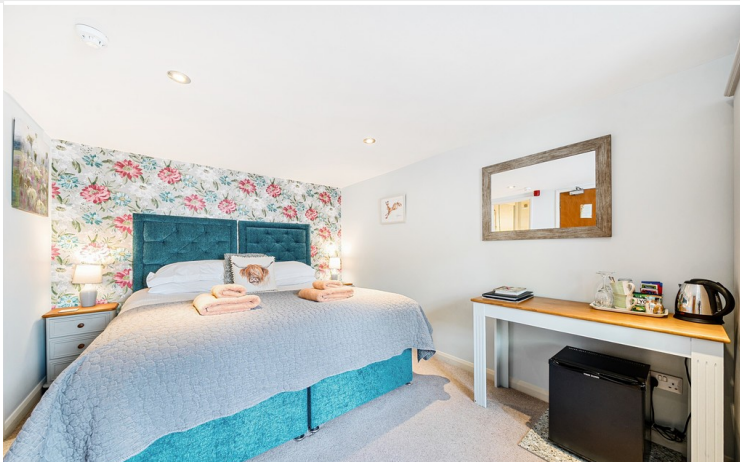
Bluebird - Double Room

Family Kitchen 26' 3" x 11' 1" (8m x 3.38m) Incredibly bright and airy thanks to the magnificent 8 panel roof pyramid skylight, letting natural light flood this room. Part tiled, having wall and base units featuring soft close doors and drawers, with complementary work surfaces including a breakfast bar for informal dining. There is an inset double sink with mixer tap, and integrated appliances include a large Bosch Scott Ceran induction hob, Bosch grill/ oven and microwave. Having plumbing provision for a dishwasher and space also to dine as well as cook.