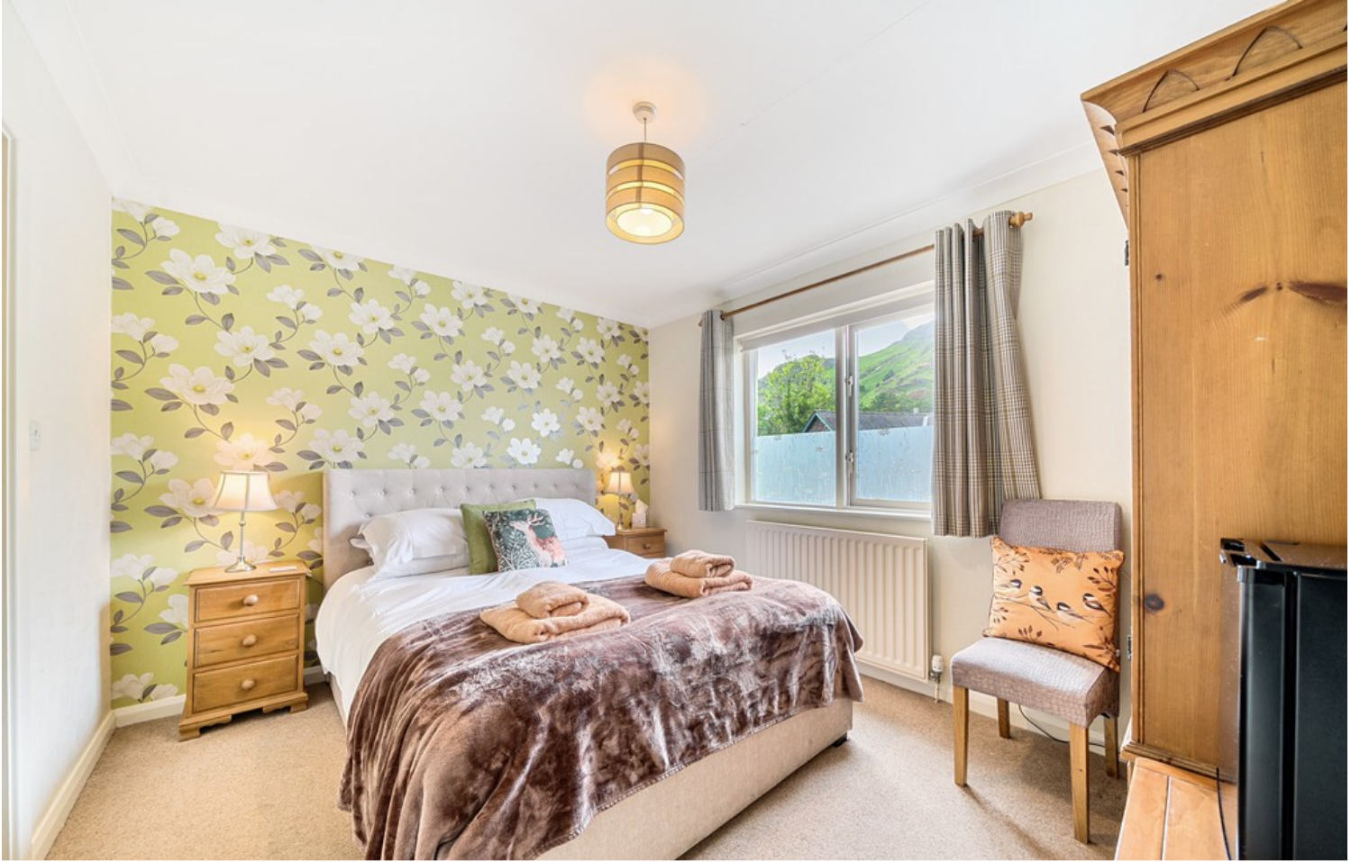
Yewdale - Double Bedroom