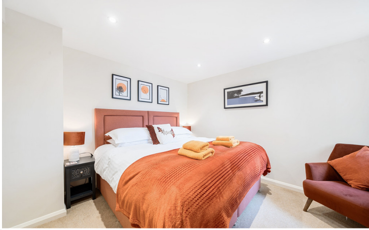
Swirl How - Double Room