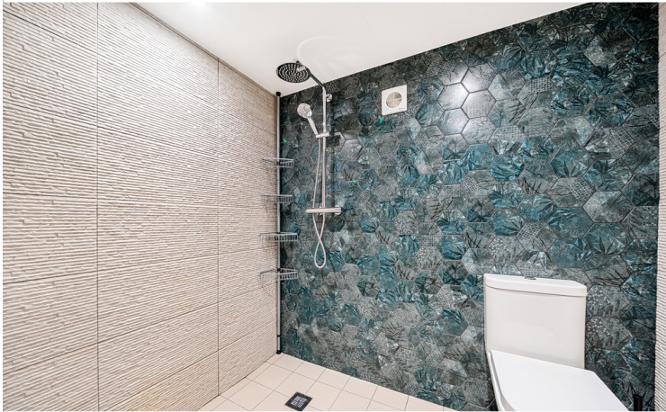
Wet Room - Swirl How