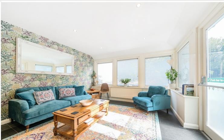
Lounge Sitting Room

For those looking for an escape from the daily stress of modern life, running a Bed and Breakfast in the heart of The English Lake District must be one of the great daydreams for many a hard working commuter - Meadowdore may just be the answer to those dreams.